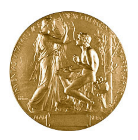
The Nobel Prize in Literature 1913 "because of his profoundly sensitive, fresh and beautiful verse, by which, with consummate skill, he has made his poetic thought, expressed in his own English words, a part of the literature of the West"